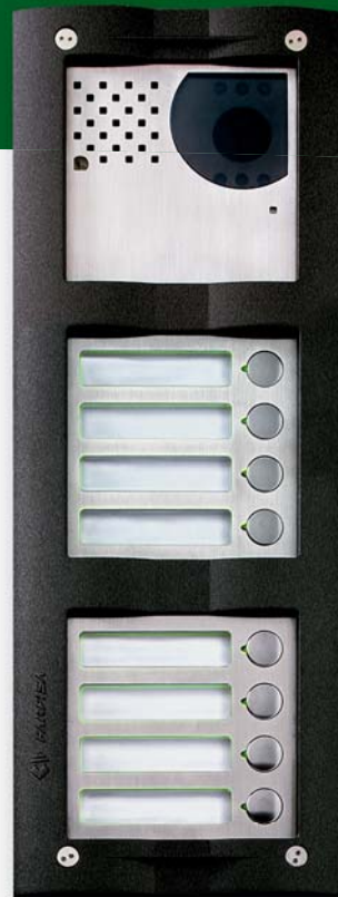
VIDEO INTERCOM COMPOSITION

Solid and antivandal modular door station series, elegant and reliable with push buttons and modules in stainless steel. Matrix is conceived to be resistant to breaking, water spout and solid penetration, it's guaranteed by IP45 degree for solid items introduction protection and by IK09 degree for mechanical shocks. All the modules are backlit thanks to green LED's for easy identification especially in poorly illuminated situations. The modularity allows installations of great number of users and configurations in vertical or horizontal way. The range is complete with aluminium front frames and built-in or surface mounting boxes. In a single module can be integrated push button, door speaker and camera, so that Matrix can be the ideal solution starting from one-way installations up to the most complex cases.