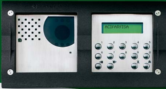
VIDEOINTERCOM COMPOSITION WITH DIGITAL CHIME